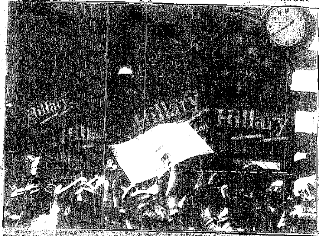
Former President Bill Clinton spoke to hundreds of people at the historic Marion Depot Sunday. He encouraged people to get out and vote — especially for his wife, Hillary.

Clinton rallies support for wife in Marion